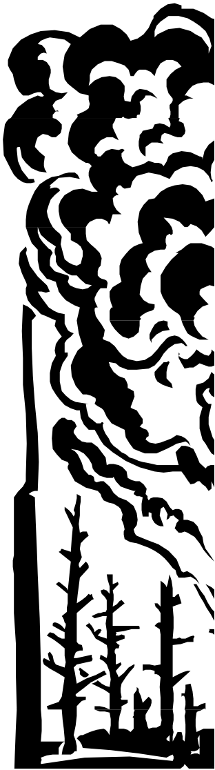
smoldering stages of a fire.

Smoke events often catch us off-guard. This guide is intended to provide local public health officials with the information they need when wildfire smoke is present so they can adequately communicate health risks and precautions to the public. It is the product of a collaborative effort by scientists, air quality specialists and public health professionals from Federal, state and local agencies.